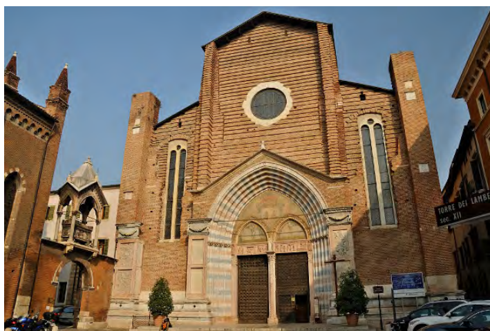
Sant'Anastasia in Verona

MidAm International, Inc. • 39 Broadway, Suite 3600 (36 th FL) • New York, NY 10006