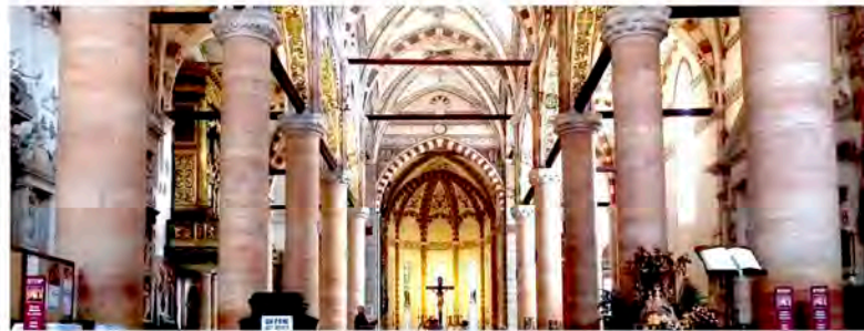
SANT' ANASTASIA, Verona