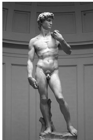
Michelangelo's David @ Academy of Fine Arts