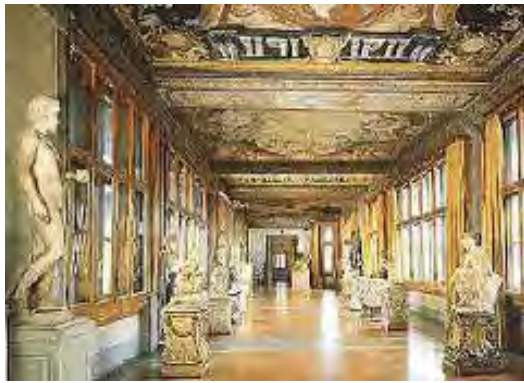
Inside of Uffizi Gallery