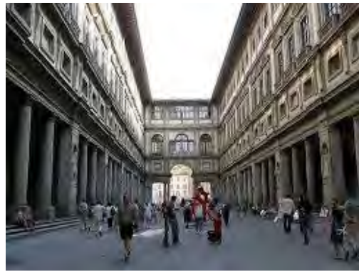
Uffizi from outside