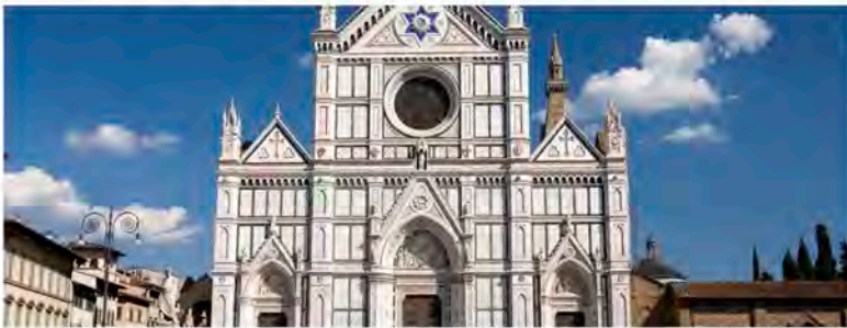
BASILICA DI SANTA CROCE, Florence

FEATURING ORCHESTRA DA CAMERA FIORENTINA & WORLD-CLASS SOLOISTS