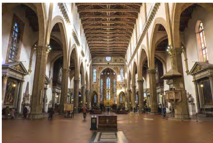
Basilica di Santa Croce in Firenze

A minimum of three groups must agree to perform for this concert to go forward.