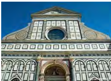
Santa Maria Novella from outside