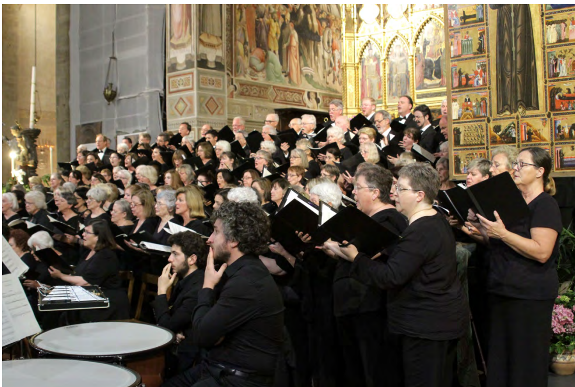
The choir delivers an exquisite performance in front of the altar in Basilica di Santa Croce in Florence