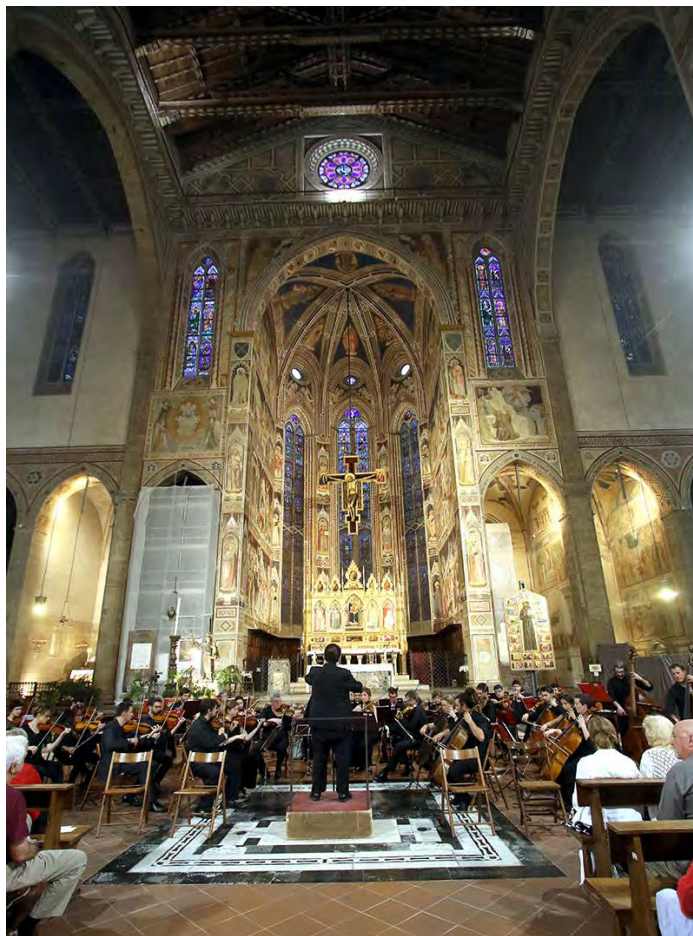
Peter Tiboris conducts Orchestra da Camera Fiorentina in Basilica di Santa Croce in Florence