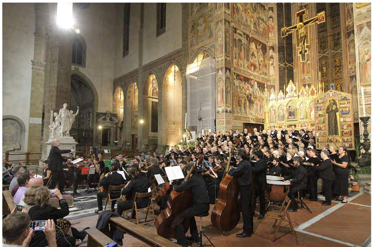
John Rutter conducts his Requiem in front of the altar in Basilica di Santa Croce in Florence