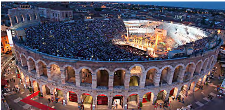
Arena di Verona

Exploring the old city is straightforward and enjoyable. Museums and monuments abound, most of them within easy walking distance of one another. The Piazza Bra is home to the Verona Arena, the third largest amphitheater in the Roman world. The Piazza delle Erbe, the hearth of the city in medieval times, contains the site of the original Roman forum. Sant'Anastasia, built between 1280 and 1400, stands as Verona's largest gothic church built for the Dominican Order. The Casa di Giulietta (Juliet's House) located close to the Scaligeri tombs and complete with balcony and a statue of the famous heroine, transports visitors back into the classic tale of Shakespeare's Romeo and Juliet. The house dates from the 13th century and the family coat of arms can still be seen on the wall. A slight problem is the balcony itself, which overlooks the courtyard – it was added in the 20th century. But that's of no matter to the hundreds of girls who every year step out onto it and gaze below seeking their Romeo among the meandering tourists.